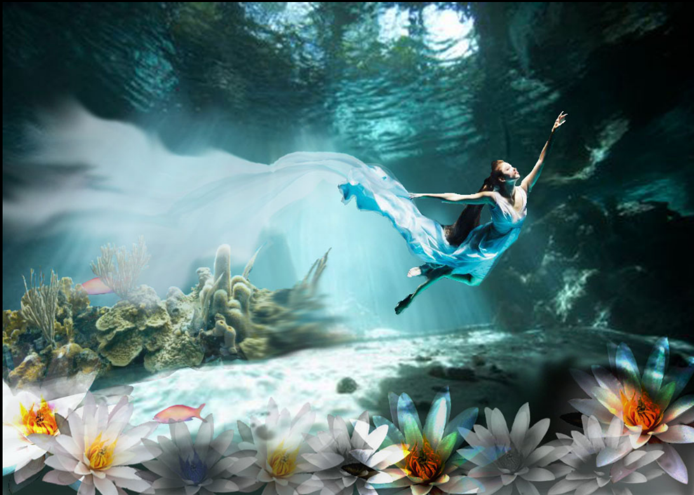
More advanced example