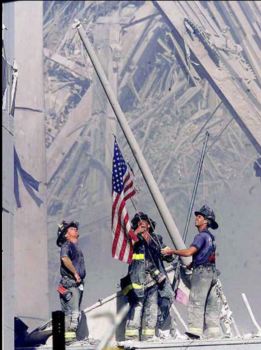
9/11/01