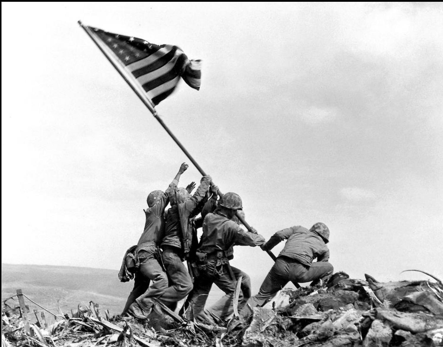
Five Marines and one Navy corpsman raising the American Flag on top of Mount Suribachi - the battle for Iwo Jima. Feb. 1945.