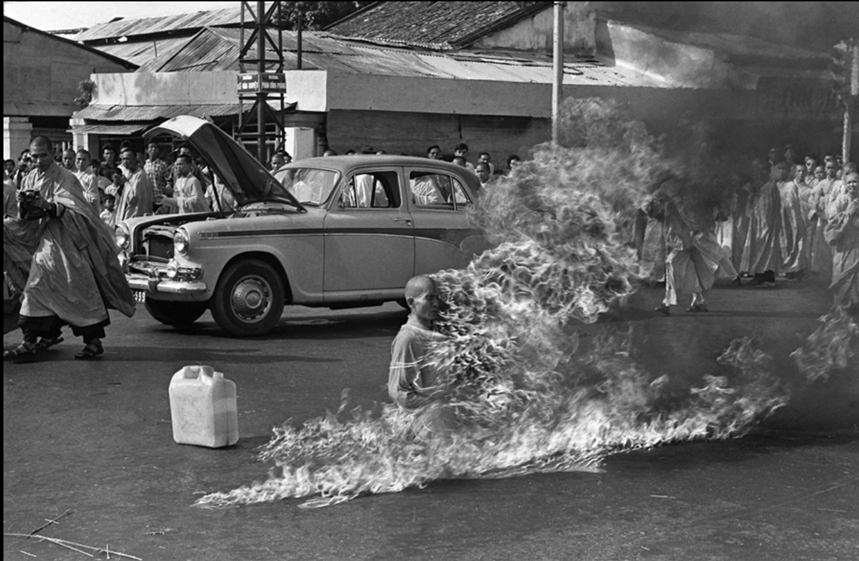
Quang Duc – Malcolm Browne – 1963