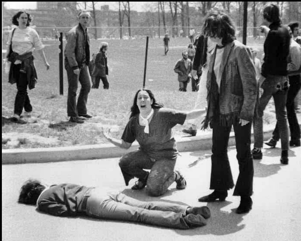
Kent State – John Filo 1970

7) Explain how all three photographs emotionally appealed to the public and impacted public opinion/social change.